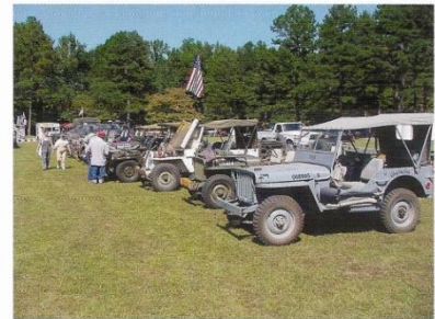
OPEN TO THE PUBLIC - FREE ADMISSION